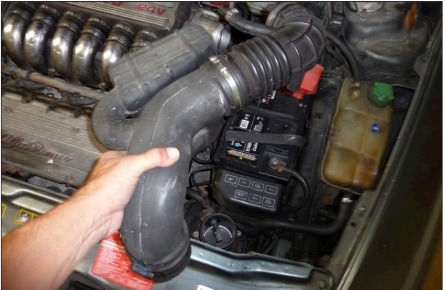
Remove the air intake hose (3 hose clips)