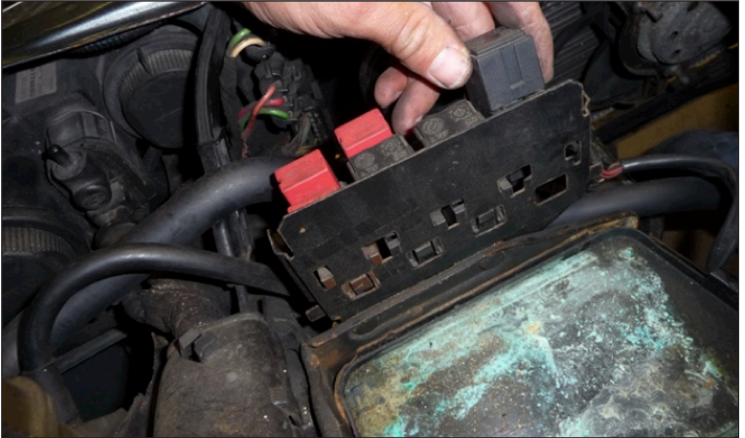
Unclip the front connectors from the battery tray.