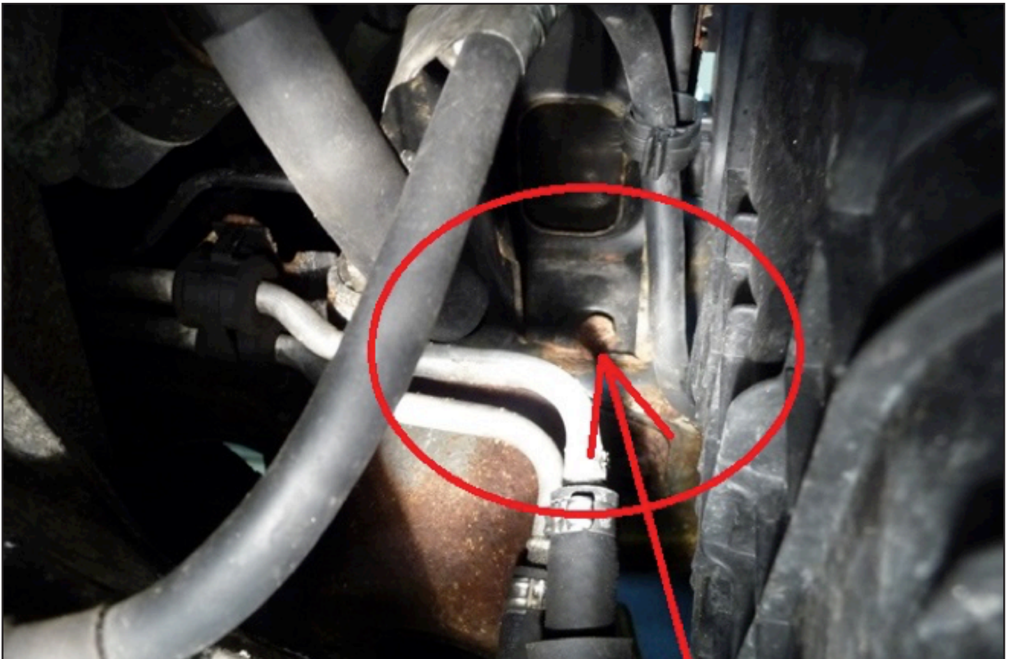
Unbolt the battery tray from the chassis. (mind the bolt below the tray underneath)