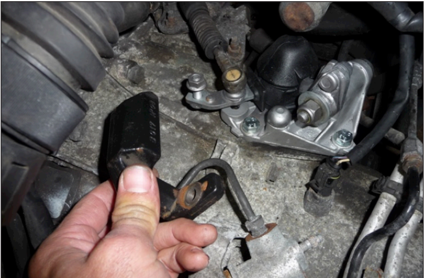
Unbolt the original shift weight. (this can be removed, it is not needed any more)