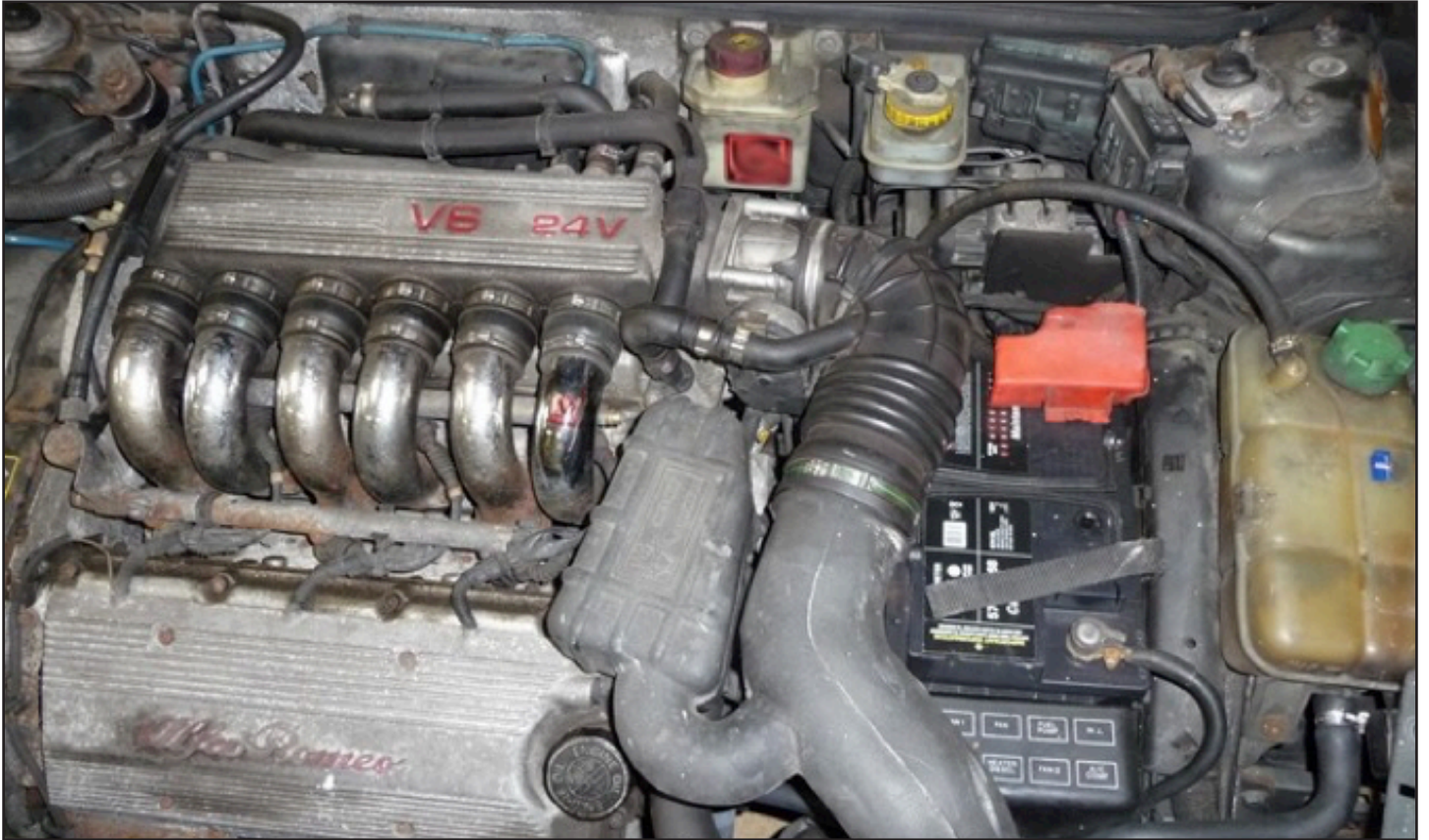
Open the bonnet