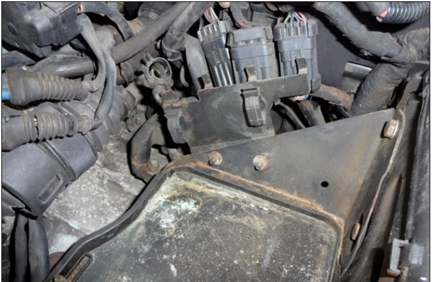
Unclip the rear connectors from the battery tray.